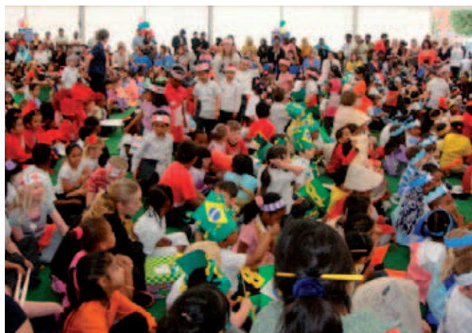
Minet School pupils and parents celebrating 'One World Week'

The Trust's grant towards One World Week celebrations at the School helped to bring together 1,500 people including parents and pupils from the two schools as well as community representatives. The event celebrated music, dance and customs which highlight the local community. Parent feedback indicates real progress in community cohesion with many commenting that this was the first event they had attended where diverse cultures had an opportunity to get together as 'one'.