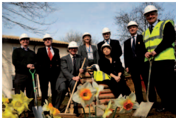
Project partners mark the commencement of building the new Townfield Community Centre

When Construction partner Apollo Property Services began work on the site, their first job was to clear the site of accumulated waste, leaves and other rubbish which had built up while the centre and its grounds were out of use. Representatives of all organisations involved in turning plans for the upgraded centre into reality got together with the Townfield Residents' Association to mark the milestone in the centre's history.