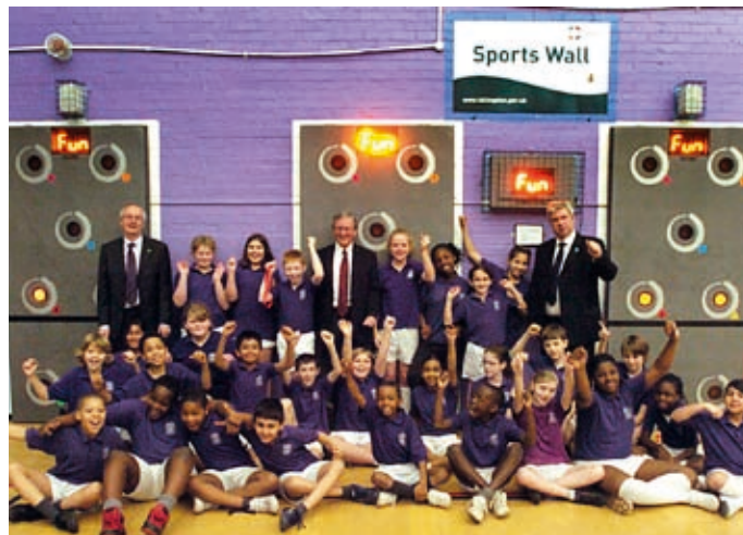
Launch of Sports Wall at Hayes Stadium

The sports wall, which is co funded by Hillingdon Council, has been installed at Hayes Stadium Sports Centre to offer users an enjoyable alternative to traditional competitive sporting activities.