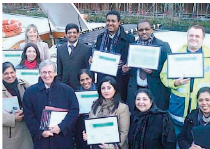
Some of the groups that have benefited from Hillingdon Community Trust Business Development Programme