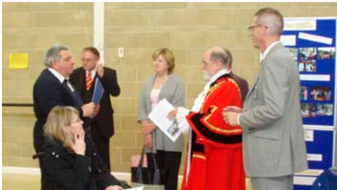
The Mayor meets members of Activities4All

So far the group has visited Woburn Safari Park, been ten pin bowling, had a trip on the West London Floating Classroom, been to see Mamma Mia at the cinema, to Portsmouth and Southsea and to the Windsor Wheel. Starting soon, the Activities 4 All is planning visits to Terminal 5, a theatre trip, flying with the British Disabled Flying Association. They will also be starting arts and crafts, football, fitness class, swimming, table tennis, tennis and Boccia.